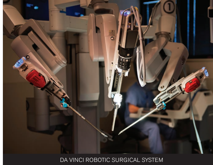
DA VINCI ROBOTIC SURGICAL SYSTEM