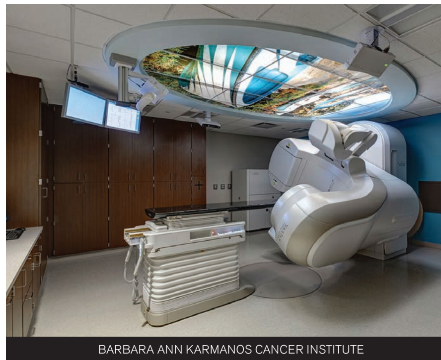
BARBARA ANN KARMANOS CANCER INSTITUTE